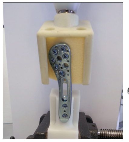
Figure 2: Test set-up